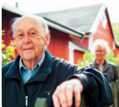
The aim of Swedish municipalities is to enable older people and people with disabilities to live in their own homes for as long as possible.

It is now easier to obtain advanced medical care in the home. In recent years, the care of severely ill and dying patients has been increasingly transferred from hospitals to special housing and older