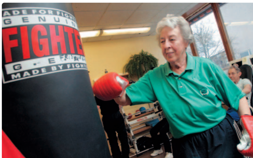
Older Swedes are increasingly healthy, which is why many of them travel, do sports and take an active part in public life.

are more demanding and discerning about the products and services they buy, partly because many pensioners are well off.