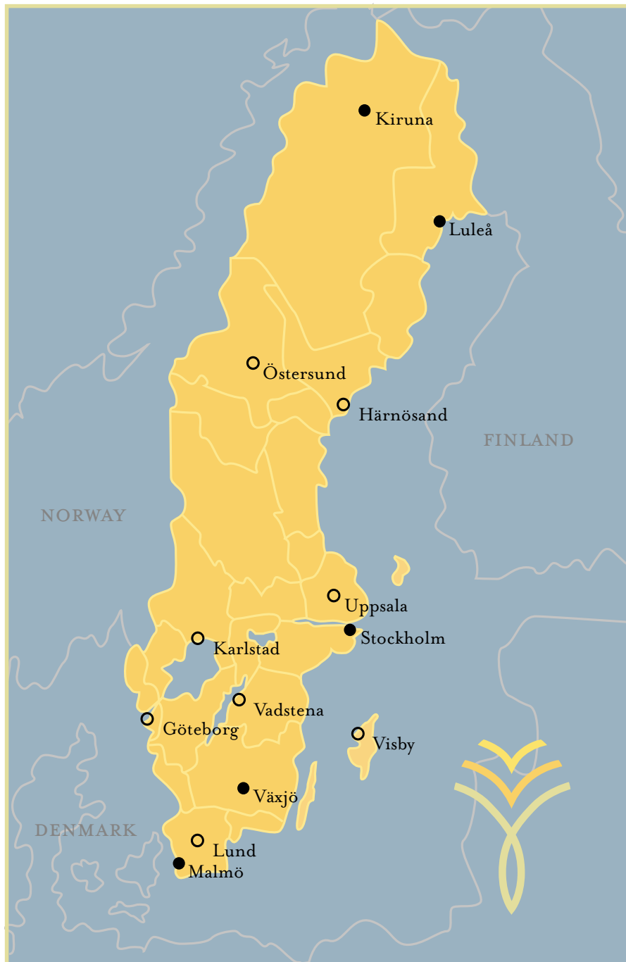
In this map of Sweden, cities in which the regional archives are located are indicated with circles. Other major Swedish cities are indicated with solid circles.