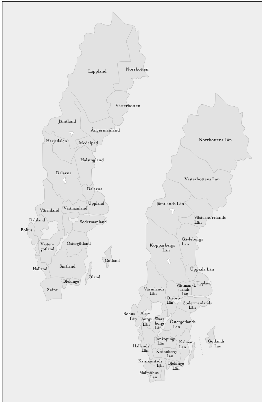
FIG. 9 Maps showing division of Sweden into landskap (provinces), the geographical units, and län (counties), the administrative units. Please note that the county borders have as of 1999 been changed. For research purposes, however, the current map provides the most relevant information.